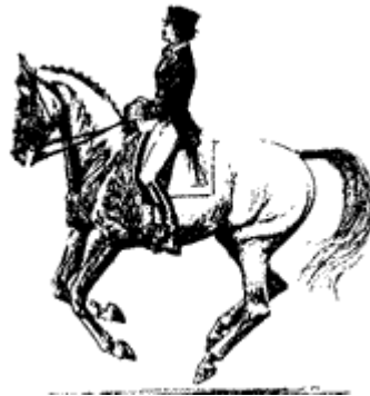
Flying Change of Leg

14. The EC, Amberlea Meadows, Show Officials and Show volunteers shall not be responsible for any damages, losses, accidents, or any actions whatsoever that may occur to any entrant, owner, exhibitor, or spectator during the show. Parties execute a binding agreement upon signing of entry form.